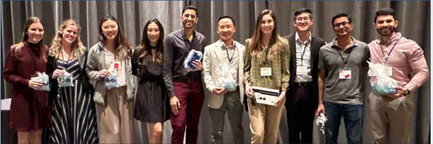
The Symposium's app featured a game that awarded residents with gift cards, products and ASDS Learn webinars.

This event was graciously supported by exhibitors and in-kind partners including La Roche-Posay, Allergan Aesthetics, AbbVie, Galderma, Hugel, Revance, Merz, Skin Health Group, Sofwave, Candela, MPR.IO, Delasco, DermAvance, Suneva and Evolus. ●